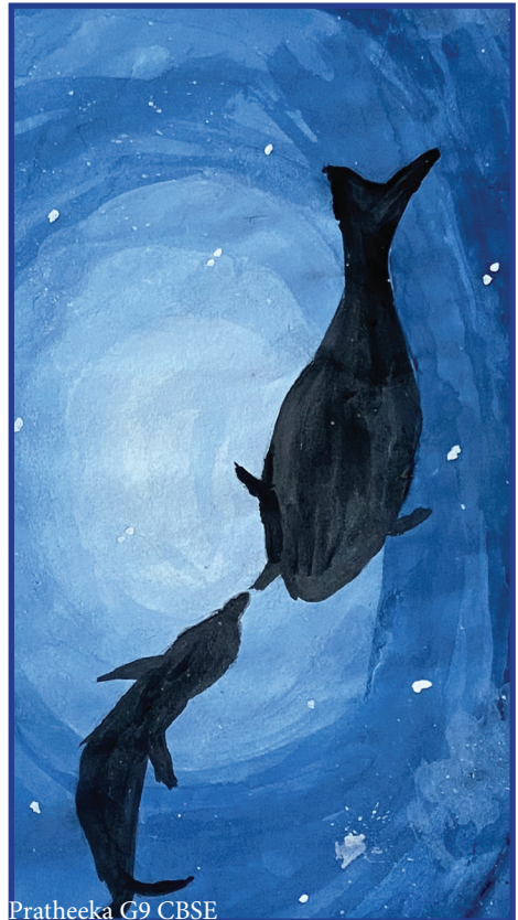
Pratheeka G9 CBSE