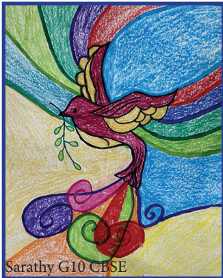
Sarathy G10 CBSE